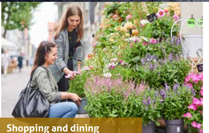
Shopping and dining

Goslar offers lots of opportunities for you to enjoy yourself within romantic atmosphere. Many cafes and restaurants around the old town offer a broad palette of different tastes and cuisine and invite to linger. At first the "Harzer Roller" may come to your mind when thinking of Harz regional cuisine. This is a typical cheese specialty of the Harz Mountains which is served with onions and cumin. But the local cuisine offers much more. For example: the traditional meal called "Hackus and Knieste" with potatoes and raw minced meat. In Goslar you will find a restaurant for every taste.