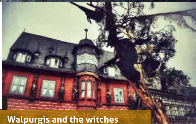
Walpurgis and the witches

Every April 30 th the famous Walpurgis festival takes place on Goslar's historic market square. People dress as witches and warlocks and dance and drink to welcome spring.