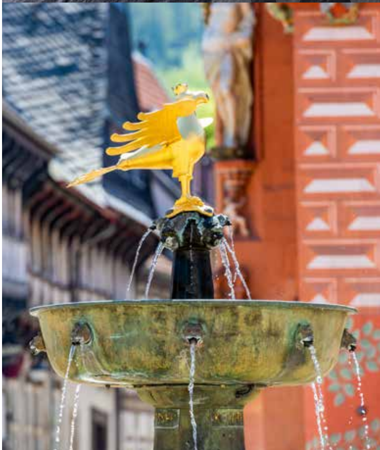
Between witches and World Heritage